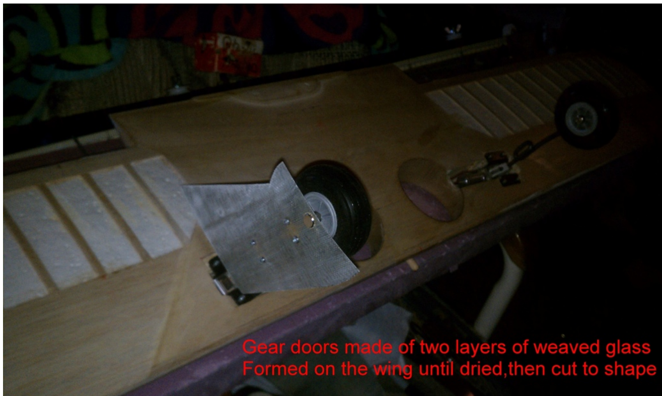
Gear doors made of two layers of weaved glass Formed on the wing until dried, then cut to shape

Thank you Jim for the great pictures and information regarding your beautiful Staggerwing