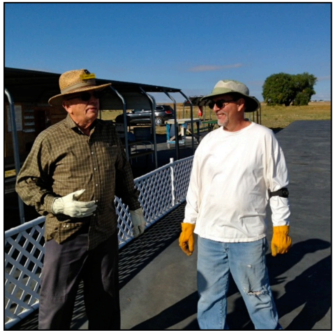
Below - "A look back"