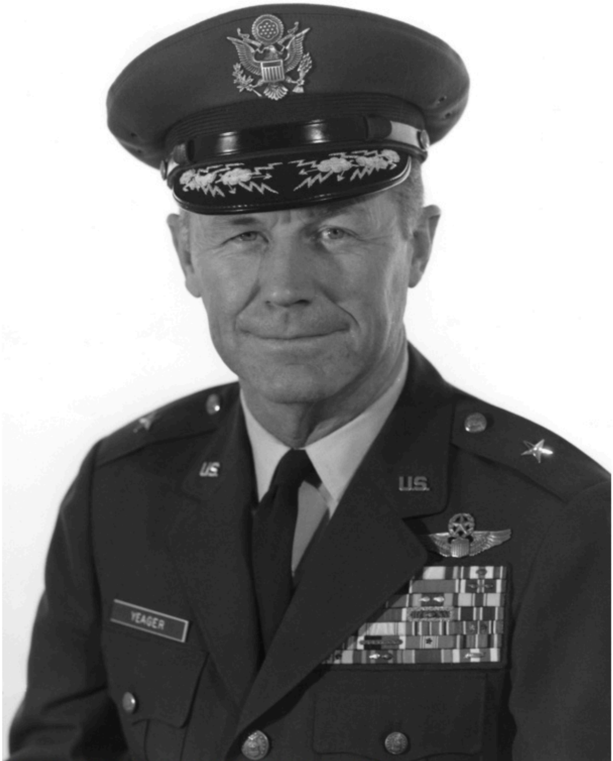
Brigadier General Charles E. Yeager, United States Air Force

http://www.biography.com/people/chuck-yeager-9538831